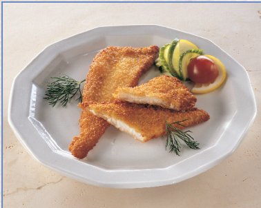
Breaded 1/4 plaice fillet. RØ4100: 40-70 g, 5,00 kg/crt. RØ4105: 70-100 g, 5,00 kg/crt.

Also available as ready-fried: RØ2115: 70-100 g, 5,00 kg/crt.