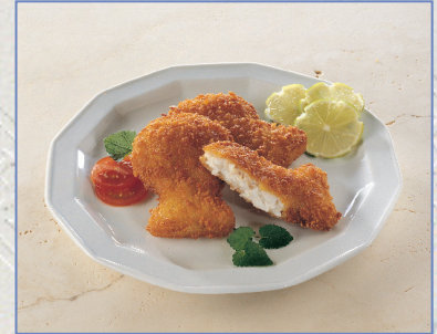
Pre-fried saithe »Fishli« (contains no gluten or lactose). SE7560: 60 g, 5,00 kg/crt.

Also available as: SE7538: 160 g, 5,28 kg/crt.