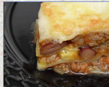
Lasagne »Tex-Mex«, LS8835: 200 g, 8,40 kg/crt.