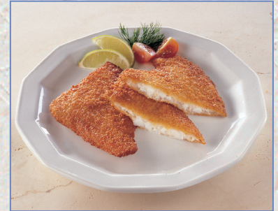
Breaded 1/2 plaice fillet. RØ2160MSC: 60-90 g, 5,00 kg/crt. RØ2100: 70-100 g, 5,00 kg/crt. RØ2105: 100-130 g, 5,00 kg/crt.

Also available as ready-fried: RØ2115: 70-100 g, 5,00 kg/crt.