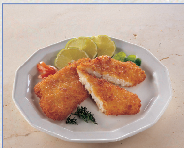
Pre-fried »Miniflipper-cod«, TO7501: 80 g, 5,04 kg/crt.