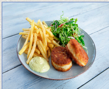
Fish cakes FR1060T: 60g, 5,00 kg/crt. FR1080T: 80g, 5,00 kg/crt.