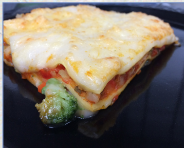
Vegetable lasagne, LS8810-S: 350 g, 8,40 kg/crt.