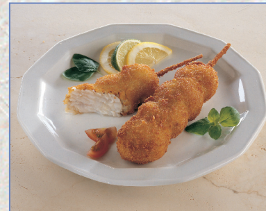
Pre-fried fish skewer. SE7520: 150 g, 6,00 kg/crt.