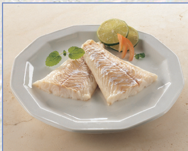
Unbreaded cod fillet (tail), TO2000: 80-150 g, 5,00 kg/crt.