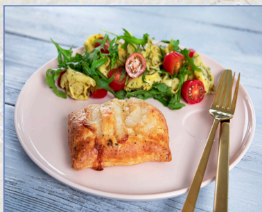
Pastry w/ shrimp & asparagus PA1252MSC-O: 36 x 125 g, 4,50 kg/crt.