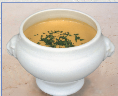
Lobster soup. HS7050: 5 x 1 kg bags, 5,00 kg/crt.