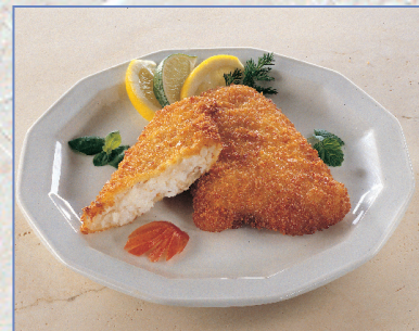
Pre-fried »Flipper-cod«, TO7500: 160 g, 5,28 kg/crt.