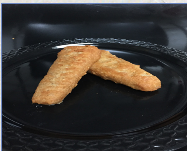
Tempurabaked Saithe: SE8510MSC: 80-120 g, 5,00 kg/ crt.