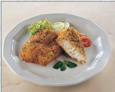
Pre-fried saithe fillet w/cheese & taco breading: SE2506: 60-90 g, 5,00 kg/crt.