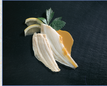
Unbreaded 1/4 plaice fillet RØ4005: 50-80 g, 5,00 kg/crt.