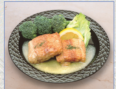
Meuniere-fried saithe, folded, SE5625: 140-170 g, 5,00 kg/crt.