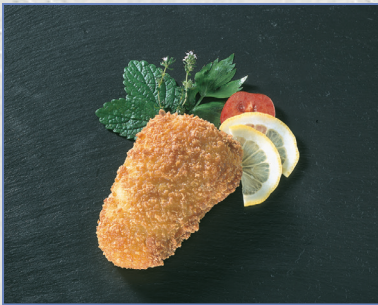
Pre-fried »Flipper-saithe« w/ tomato SE6501: 140-160g, 5,10 kg/crt.