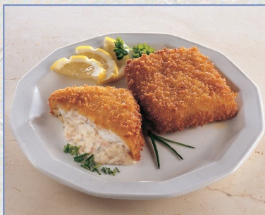
Pre-fried »Flipper-saithe« w/Cordon Bleu SE7530: 180 g, 6,48 kg/crt.