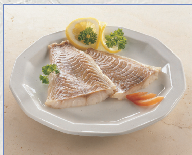
Unbreaded saithe fillet, SE2000: 130-150 g, 5,00 kg/crt.