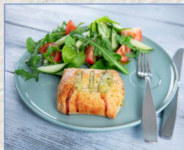
Pastry w/ Salmon & Spinach PA1251-O: 36 x 125 g, 4,50 kg/crt.