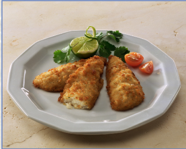
Pre-fried »Mini Northsea cod«. Veg. marinated (contains no gluten) TO2553: 50 g, 5,00 kg/crt