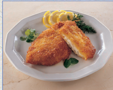
Pre-fried double plaice fillet, RØ3500: 140-160 g, 5,00 kg/crt.

Also available as ready-fried: RØ4115: 40-70 g, 5,00 kg/crt.