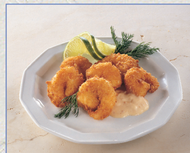
Pre-fried giant prawns, VR2500: 10-12 g, 5,00 kg/crt.