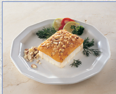
Saithe gratin w/ almond. SE7710: 160 g, 6,40 kg/crt.