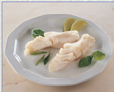
Unbreaded cod loins, TO4000: 100-130 g, 5,00 kg/crt.