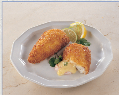
Pre-fried ¼ plaice fillet, formed, w/hollandaise/shrimps. RØ6513: 100 g, 5,00 kg/crt.