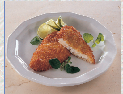
Pre-fried »Sea Flounder« RØ2550: 95 g, 5,00 kg/crt.

Also available breaded for pan or deep fat frying: RØ2150: 85 g, 5,00 kg/crt.