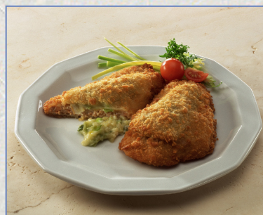
Pre-fried »Flipper-salmon« w/ leek. LA6505: 150 g, 5,10 kg/crt.