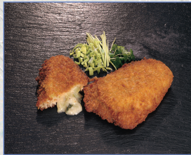
Pre-fried »Flipper-saithe« w/ leek SE6505: 140-160 g, 5,10 kg/crt.