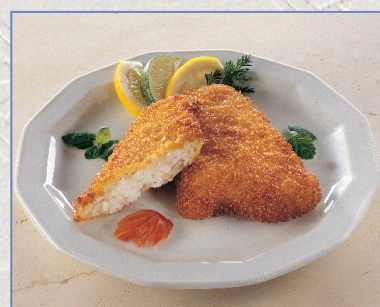
Pre-fried »Flipper-saithe«. SE7535: 160 g, 5,28 kg/crt.

Also available as »Mini-flippersaithe«: SE7550 80 g, 5,04 kg/crt.