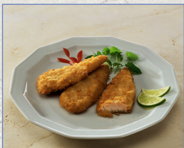
Pre-fried »Mini-salmon«. LA2555: 50 g, 5,00 kg/crt.