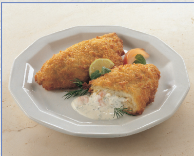
Pre-fried »Flipper-saithe« w/ shrimps-dill SE7549: 180-190 g, 5,55 kg/crt.