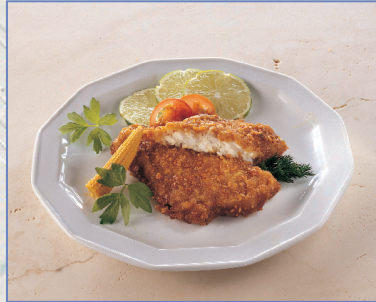
Pre-fried »Mini-flipper-saithe« w/ maize-breading. (contains no gluten or lactose). SE7555: 80 g, 5,04 kg/crt.

Also available as: SE7538: 160 g, 5,28 kg/crt.