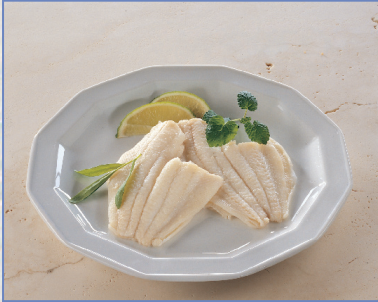
Unbreaded 1/2 plaice fillet. RØ2000: 50-80 g, 5,00 kg/crt.