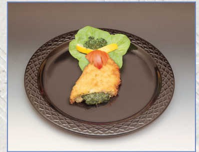
Pre-fried double »Flipper-saithe« »Florentiner« SE7547: 180-190 g, 5,55 kg/crt.