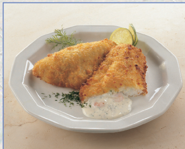
Pre-fried double plaice fillet w/shrimps & dill. RØ6500: 160-190 g, 5,00 kg/crt. RØ6532: 180 g, 5,76 kg/crt.

Also available breaded for pan-frying: RØ6100: 150-170 g, 5,00 kg/crt.