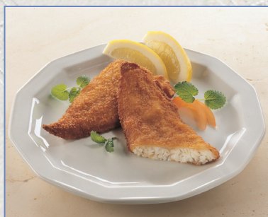
Breaded saithe fillet SE2100: 130-160 g, 5,00 kg/crt. SE2107: 70-100 g, 5,00 kg/crt.