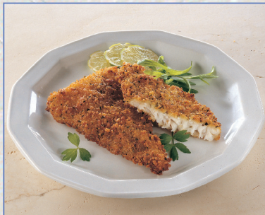
Pre-fried saithe fillet w/herbal breading, SE2501: 140-160 g, 5,00 kg/crt.

Also available with cheese & taco breading: