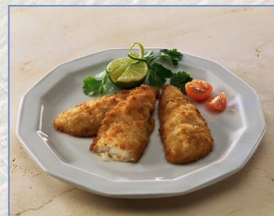
Pre-fried »Mini-cod«, TO2550: 90-100 g, 5,00 kg/crt