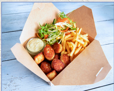
Fish cakes FR1020TMS: 20g, 5,00 kg/crt.