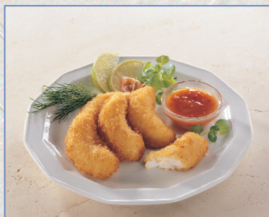
Pre-fried cod nuggets, TO7528: 25 g, 5,00 kg/crt.