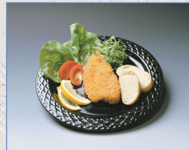
Oriental breaded plaice fillet ¼ RØ7210: 75 g, 5,00 kg/crt.

Also available breaded for pan-frying: RØ6100: 150-170 g, 5,00 kg/crt.