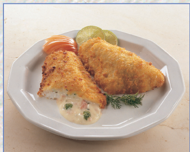
Pre-fried »Flipper-saithe« w/ broccoli, cheese & ham, SE6543: 120 g, 5,40 kg/crt.

Also available as: SE6503: 150 g, 5,10 kg/crt.