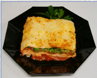
Salmon lasagne w/broccoli. LS8800: 350 g, 8,40 kg/crt.